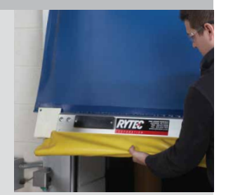
Quick-Set tabs for damage free release