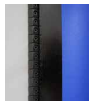
Durable drive teeth remain intact under high pressure

The FlexTec also features an exclusive 1-ply Rylon™ panel material, providing increased durability and improved wind and pressure resistance over vinyl panels typically used by competitors. In addition, a low-friction drive system (patent pending) is standard. FlexTec models are available for openings up to 16 feet wide and up to 20 feet high.