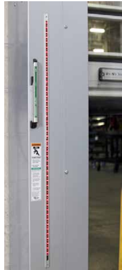
Safety Light System

Protect staff, customers, vehicles and equipment.