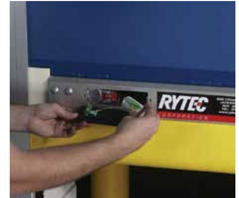
Wireless Bottom Edge